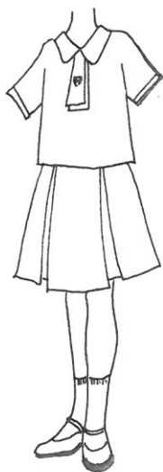
Girl's Uniform (Junior Secondary)