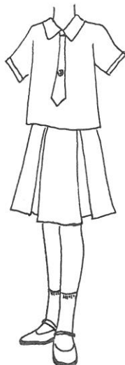
Girl's Uniform (Senior Secondary)